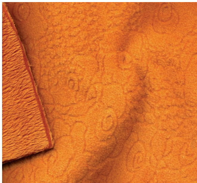
High pile performance fabrics from Concept III