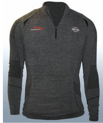
PrimaLoft yarn base layer garment, made from 50% PrimaLoft blended with 50% Merino wool

The Merino State Collection, made with naturally sustainable, renewable and biodegradable Merino wool also includes blends containing other environmentally favourable fibres such as bamboo, milk,